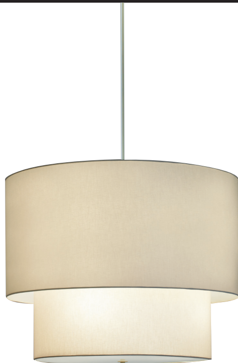
Double Drum Pendant DRD30-TU-CS